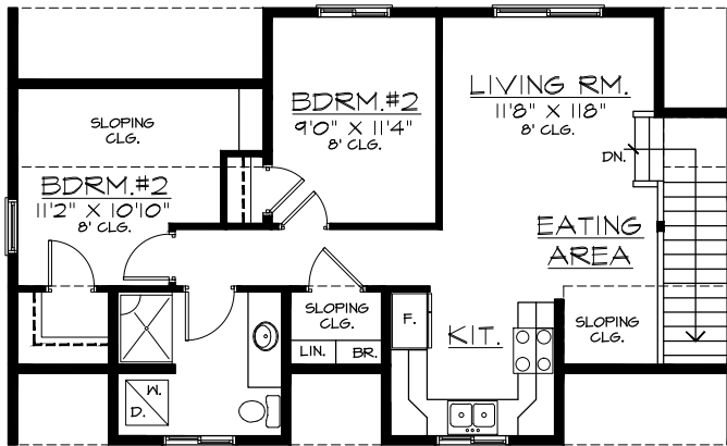
MAIN FLOOR 786 SQ. FT.